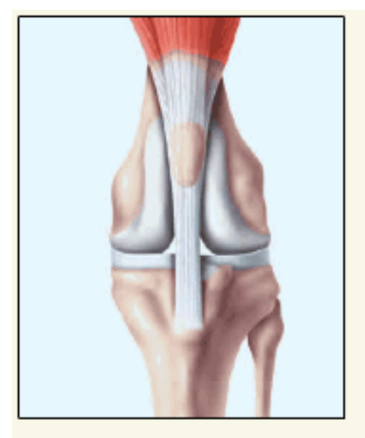
Normal patellar alignment. The patella and quadriceps are in alignment and the patella is seated in the groove.